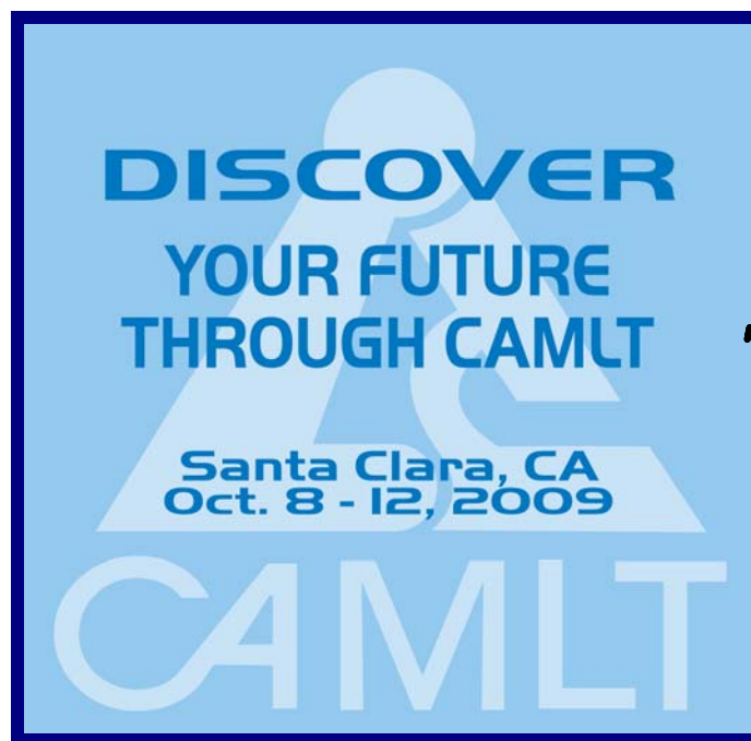
Exhibit Days Friday and Saturday October 9 and 10, 2009

Santa Clara Hyatt Regency Hotel Santa Clara, California